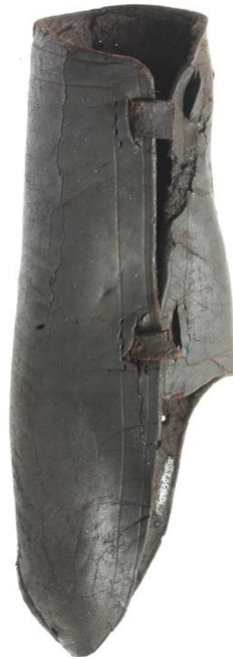
Fig. 2. Leather vambrace from Dordrecht. Collection Regional Archives Dordrecht.